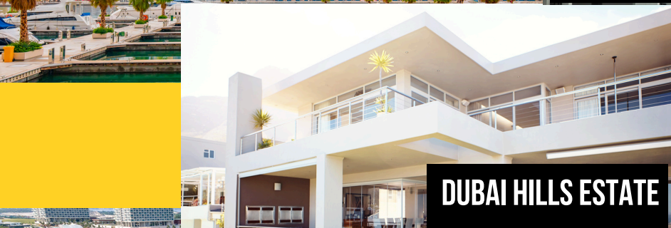
DUBAI HILLS ESTATE